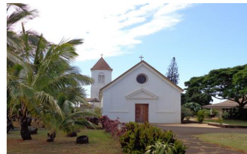
OLD HISTORICAL CHURCH