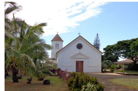
OLD HISTORICAL CHURCH