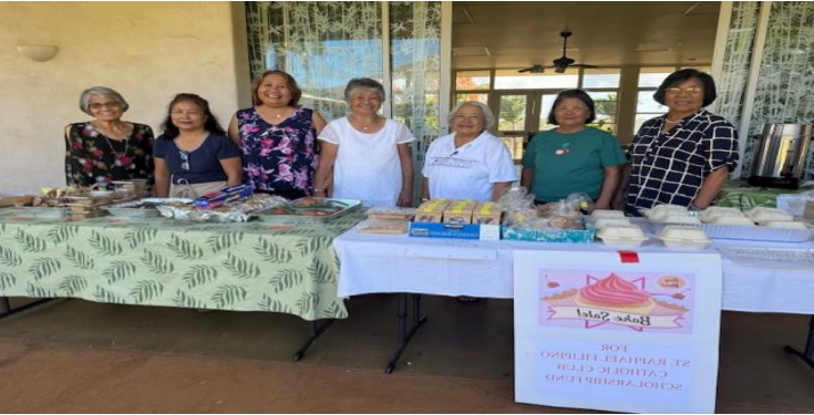
St. Raphael Filipino Catholic Club organized a Bake Sale on July 13 for the tuition assistance program. Thank you to all who donated, helped and supported with this successful event.

We are delighted to announce that three young Missionaries will be ordained as La Salette's Priests this August. Who knows – one day, they might be assigned to Hawaii when the need arises.