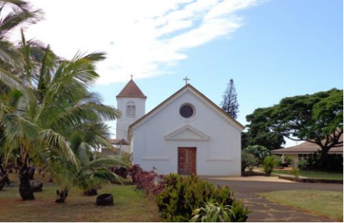
OLD HISTORICAL CHURCH