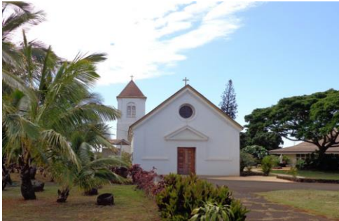
OLD HISTORICAL CHURCH