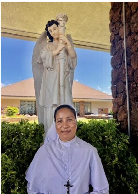
St. Raphael Church Religious Education Coordinator and Parish Secretary