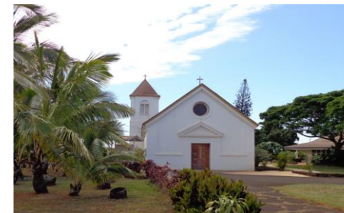
OLD HISTORICAL CHURCH