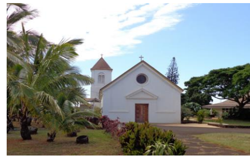
OLD HISTORICAL CHURCH