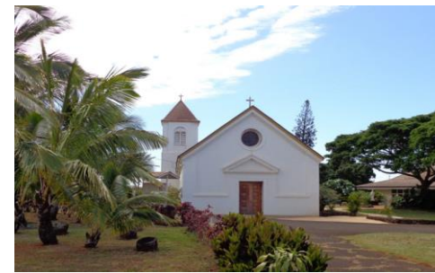
OLD HISTORICAL CHURCH