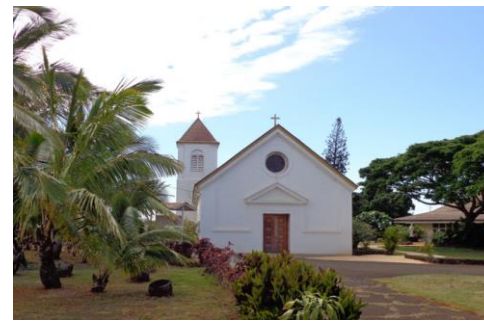
OLD HISTORICAL CHURCH