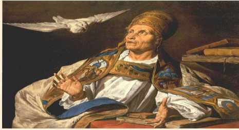
Saint Gregory the Great Feast Day— September 3rd

Gregory was content to be a monk, but he willingly served the Church in other ways when asked. He sacrificed his own preferences in many ways, especially when he was called to be Bishop of Rome. Once he was called to public service, Gregory gave his considerable energies completely to this work. Gregory's description of bishops as physicians fits in well with Pope Francis' description of the Church as a "field hospital."