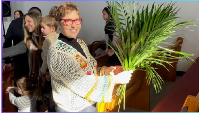
The Palms arrive and are ready to be distributed

On Palm Sunday we commemorate the Triumphant arrival in Jerusalem of Jesus by having the children carry the palms into the church.