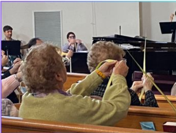
Everyone is trying it