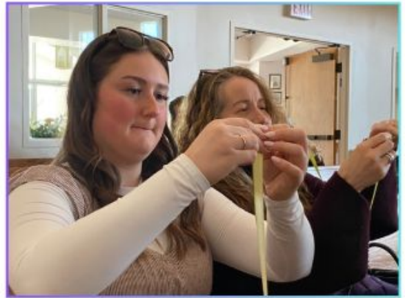
Focusing on folding!