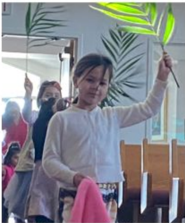
The children coming in and waving their palms.