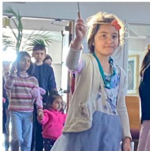
The older children are helping the younger children and guiding them around the church.