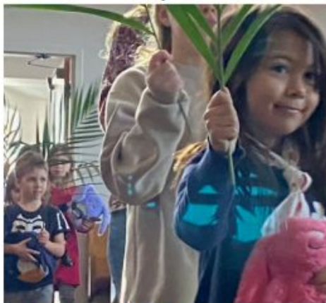
It looks like people are happy.