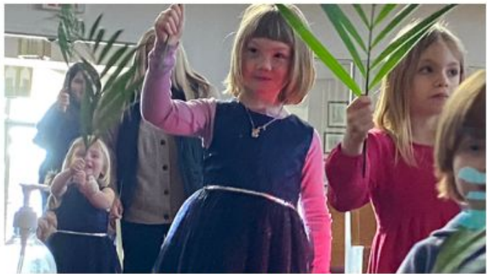
The palms they are waving.