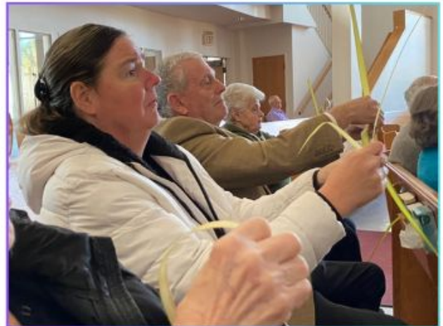
It takes a lot of focus to get it right!