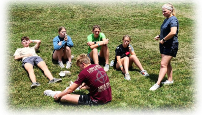
This youth group from Trinity Lutheran in Hudson, WI came in July to help Family Promise paint and do other work at the Sycamore Tree campus.

Although summer has not yet passed, summer vacation has and it is back to school time and back to work. 1 st UMC and Family Promise never stopped working. For those who were able to tour the newly acquired Sycamore Tree property, the first-hand view of all that space was impressive. Since the tours, volunteer groups from Next Steps have made many improvements but there is still much to do.