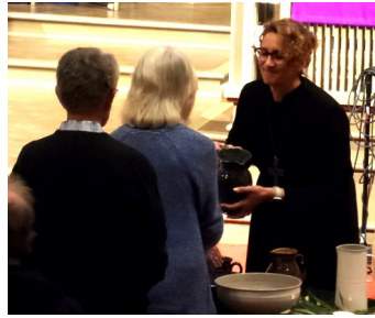
Remembering The Last Supper with handwashing and communion.