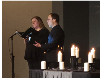
Reminders on Good Friday that The Light overcomes darkness.