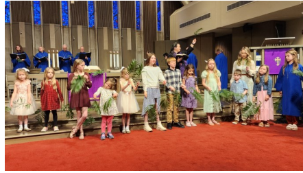
Waving branches on Palm Sunday

Easter in Maryville is always a special time and it is our sincere hope this time was special for you. Remember, the Easter season continues through Pentecost on June 8th. So continue to celebrate the Good News that "Christ is risen! Christ is risen Indeed!