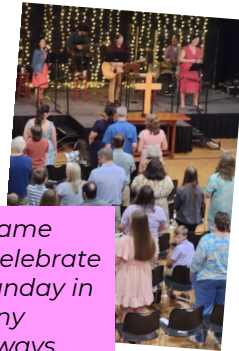
People came together to celebrate on Easter Sunday in so many different ways.