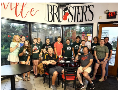
Several 1st Youth students gave their time to help make Vacation Bible School a success. As a “reward” they all got to go out for ice cream after one of the sessions.