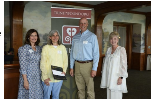
Trinity Health Foundation Awards Luncheon