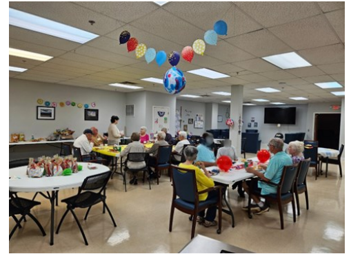
Summer, Birthday, and Thank You's!

To receive DayBreak Morning Light updates, please go to daybreakcare.org or follow DayBreak on Facebook .