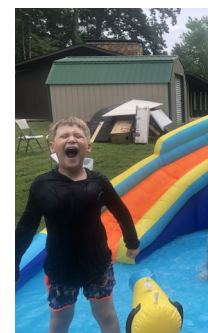
The Bayou Back to School Party and the Blessing of the Backpacks happened on July 28th.