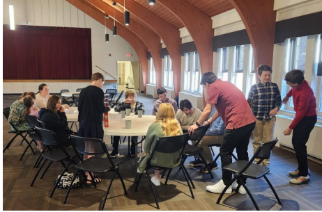
First Future Sunday School meets each Sunday at 9:15 am