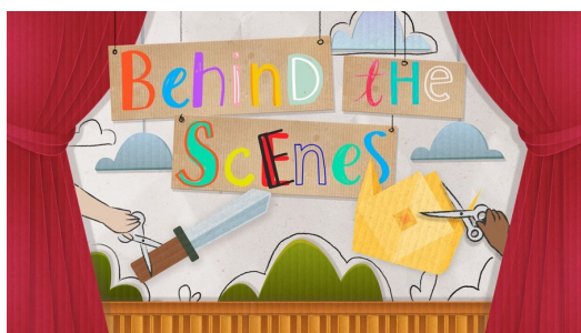
In November, Kids Own Worship goes "Behind the Scenes" for a closer look at the story of Esther.