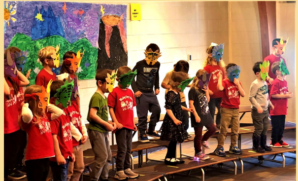
Having Wesley Day School here at 1st Church is a true joy, especially when it's time for "Dinosaur Day!" How many of you remember all those special Jurassic Jukebox Tunes?

If you've participated in this past devotional project, a past one or want to get involved in the future, let us know by emailing communication@1stchurch.org . If we can get a strong enough core group of devotion writers then we'll try and take this project a step further. Thanks again to everyone who helped get us the devotionals during the Lenten season.