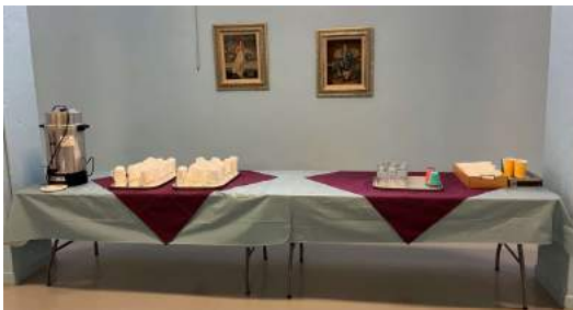
Ready and waiting...