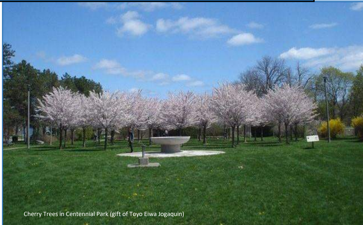
Cherry Trees in Centennial Park (gift of Toyo Eiwa Jogaquin)