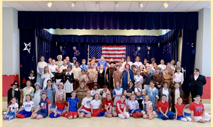
“The American Dream”

At Blessed Sacrament Catholic School, we are deeply committed to instilling in our students a profound respect for our nation, its history, and the men and women who have served and continue to serve in its defense.