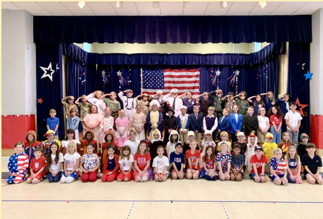
“A Very Patriotic Pageant”