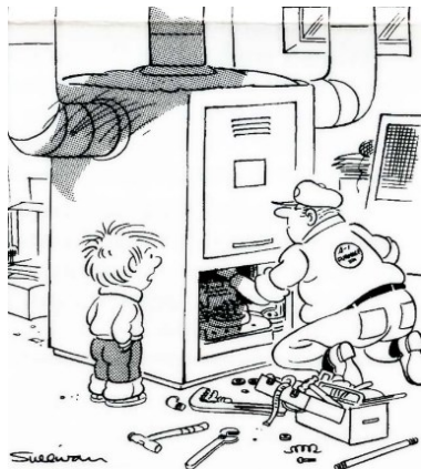
Dad says you’re converting our furnace. What religion was it before?

“Let no one doubt concerning the goodness of God; even if a person’s sins were as dark as night, God’s mercy is stronger than our misery.” (St. Faustina)