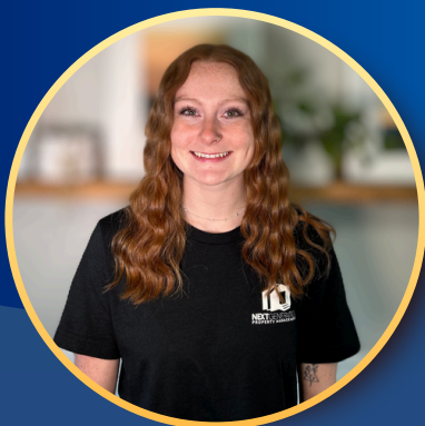
AMIYA Marketing/ Maintenance