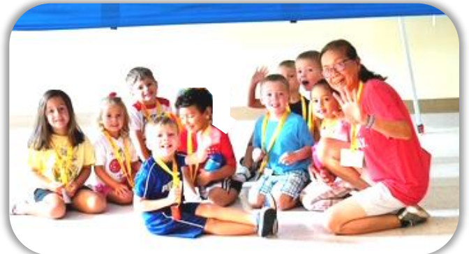
Vacation Bible School 2025