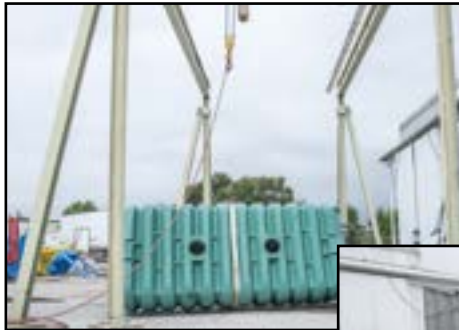
D2 has no cracking.

Advantage: No additional support is required.