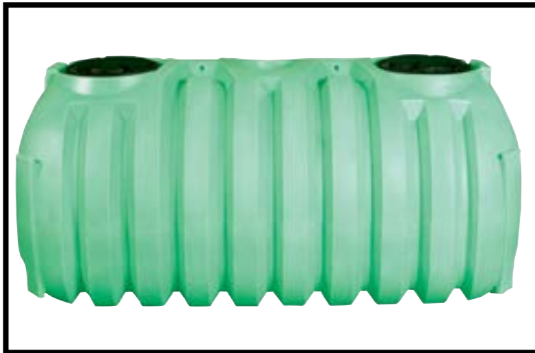
One-piece Seamless Tank