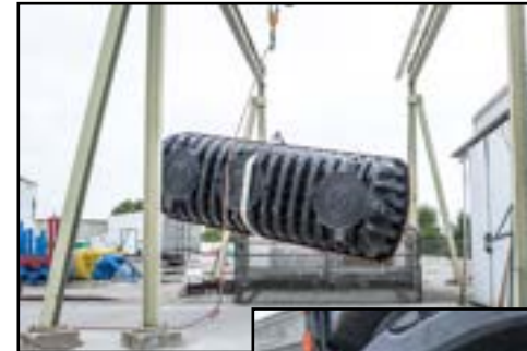
Tank cracked, clips on seam were dislodged.

A modest 6 ft. drop test tells the story..