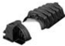
PRO4® ONSITE CHAMBERS