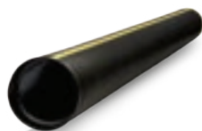
GOLDFLO® DUAL-WALL STICKS