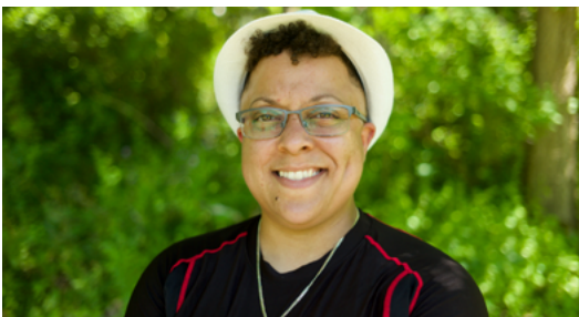
TJ Women's Club Coach and President