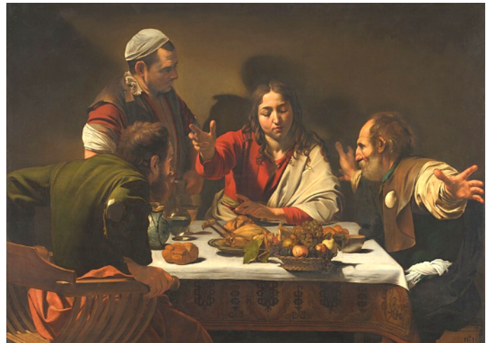
The Supper at Emmaus by Michelangelo Merisi da Caravaggio (1601)

Among the various post-resurrection accounts, the story of two individuals walking to Emmaus is one of my favorites. It begins with the human experience of loss. We hear the statement, “We had hoped.” The disciples put their hope in Jesus, but the crucifixion crushed that hope.