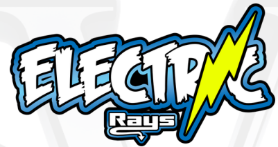
International Open Coed Large 6

AGE GRID: Worlds teams are in the Senior and Open Age Divisions.