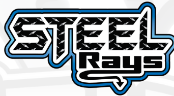
Senior Large Coed 6