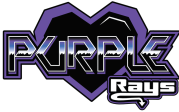
Senior Small 6

Below are the projected teams/divisions: