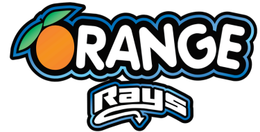
Senior Large 6