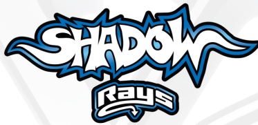
Senior Medium Coed 6