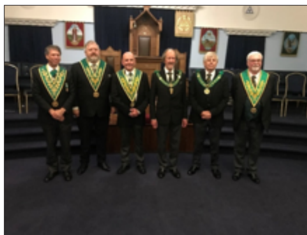
Devon & Cornwall