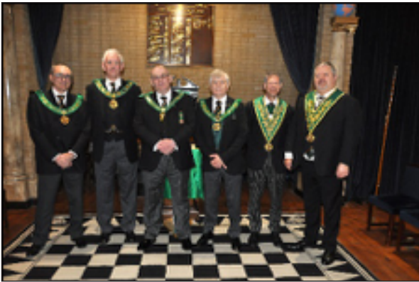
Herts & Beds