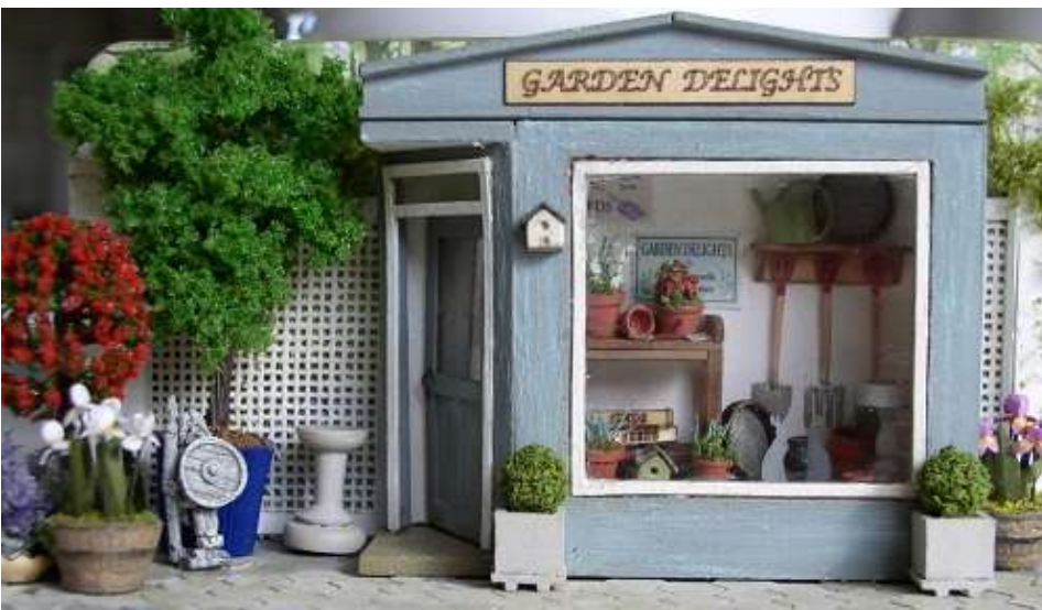
From Mae Karoli:

After several years of pondering what type of store I would make using the "Window Shopping" project from NAME Day 2015, I decided to make a