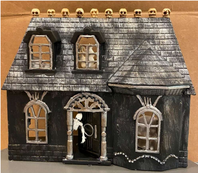
Now complete is this lovely gingerbread house from Preble McDaniel.