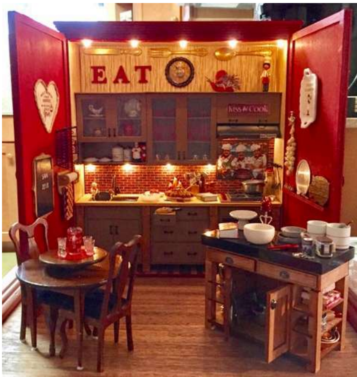
From Cheryl Polito: