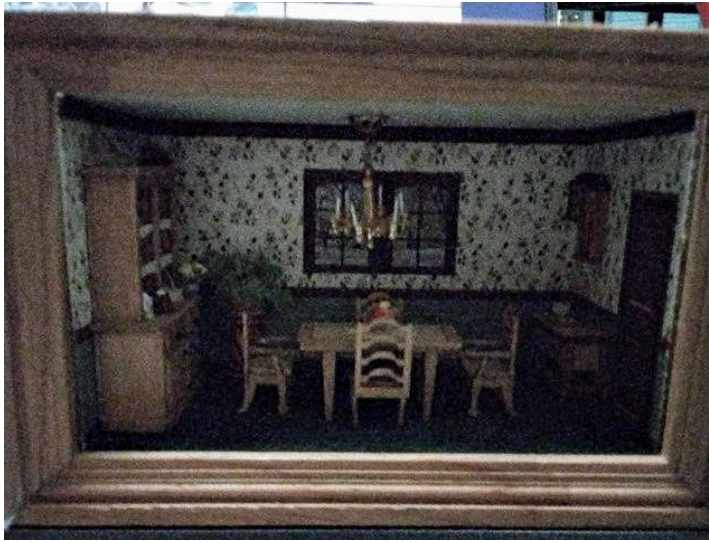
The kitchen work table from 2011