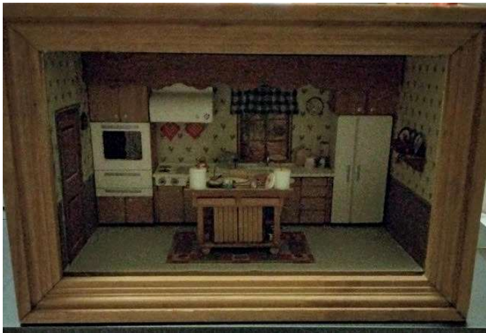
The alcove from 2012