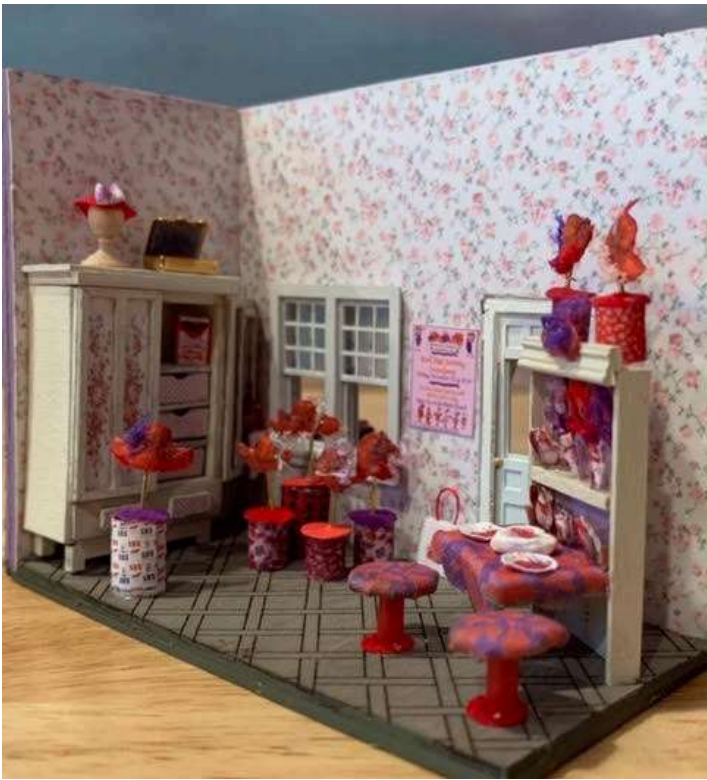
The 2019 & 2020 craft room.