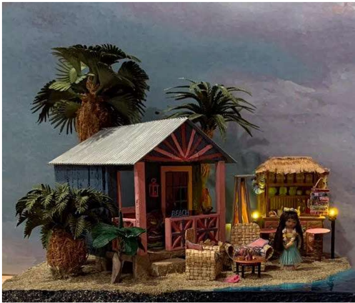
And finally the 2022 display box.