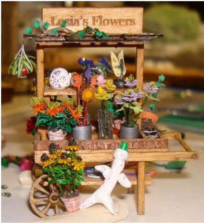
From Suzie Aguilar: