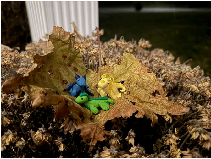
----- From Beverly Fleming: