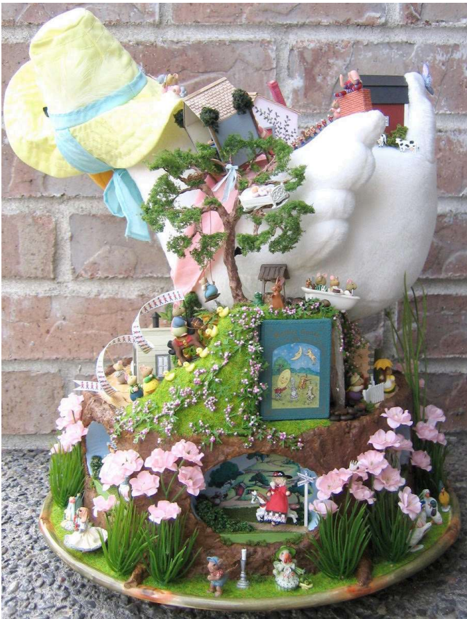
From Sarita Speros: