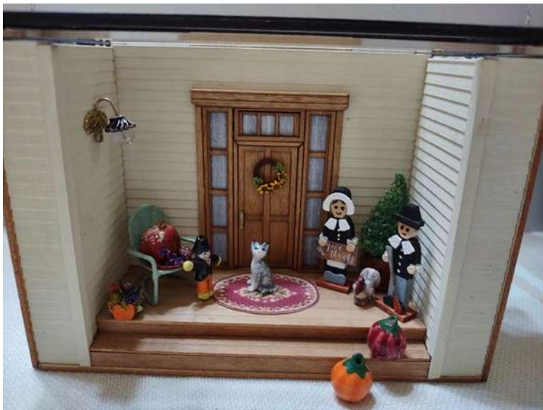
From Cat Wingler: