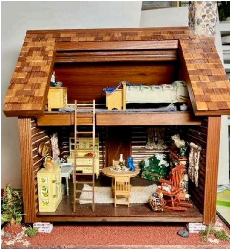
1/2 inch scale log cabin. "Hunting and Fishing Season"