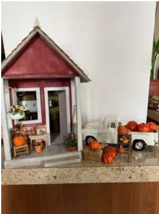
From Carin Shapiro: This is a WIP, mostly made up of NAME convention garage sale finds and finds from NAME online auctions.