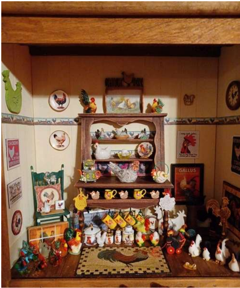
From Vicki Scidmore: A Thanksgiving porch scene.