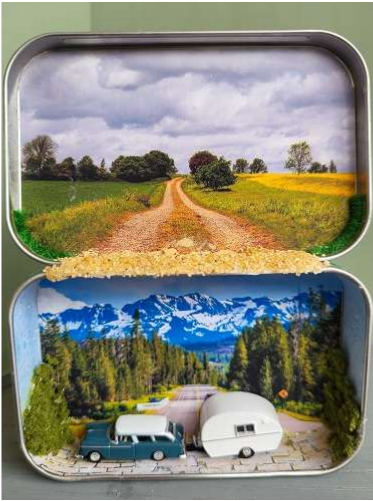
A mushroom house where the little gnomes live underground.