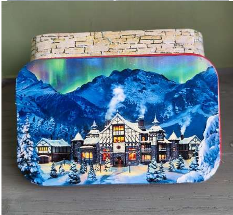
Theme from "The Nutcracker". The ballerina is by Hallmark and snow is air dry clay.