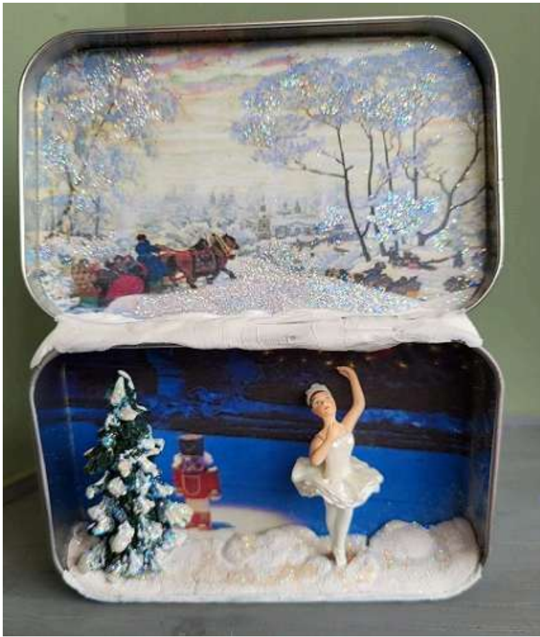
Road trip with a trailer and picture cutouts from old calendars.