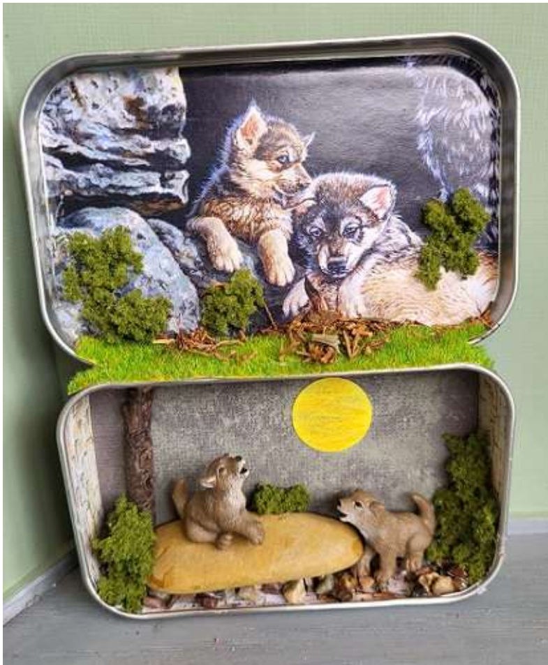
This tin was made for a wedding gift, coach and horses with figurines are 1:160 scale.