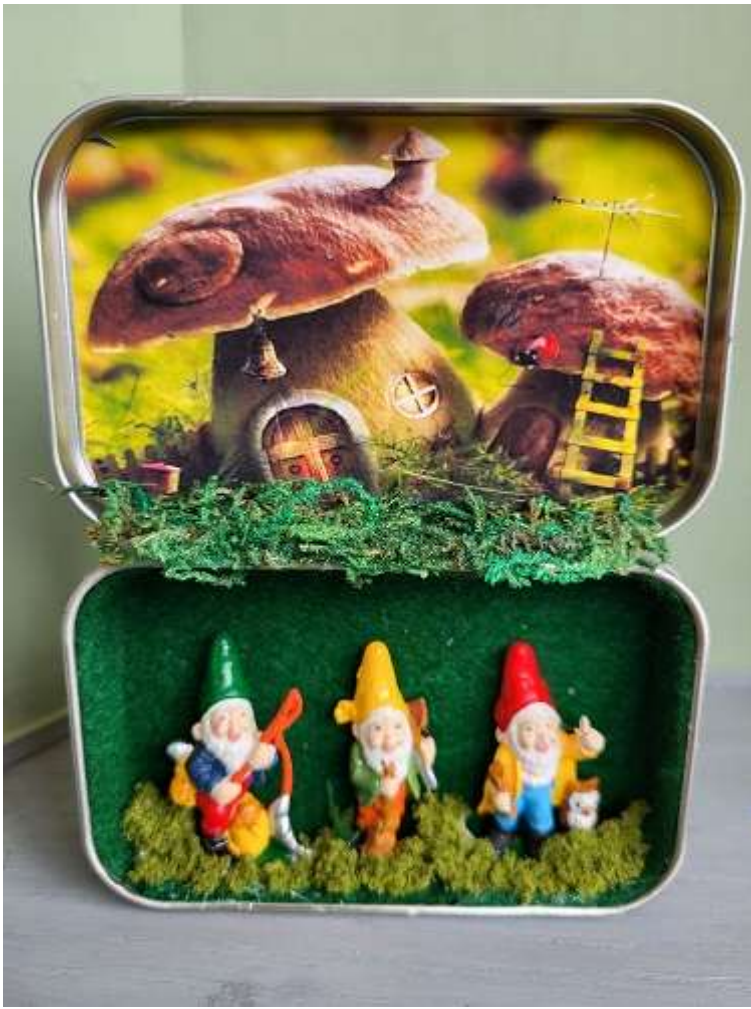
Medieval winter scene with matching outside cover. A quarter inch scale couple and a fountain were placed inside.