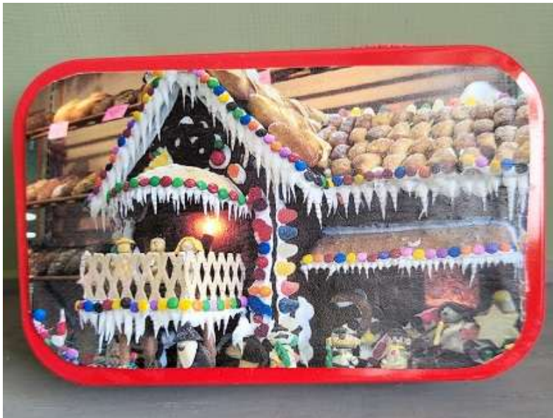
Santa's workshop shows vintage figurines of Santa and his elves making toys in the workshop. On the cover is his house at the north pole.