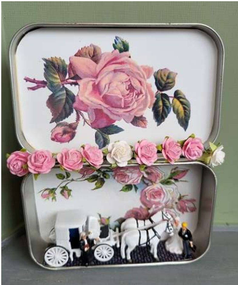
Old McDonald's farm with figurines in quarter inch.