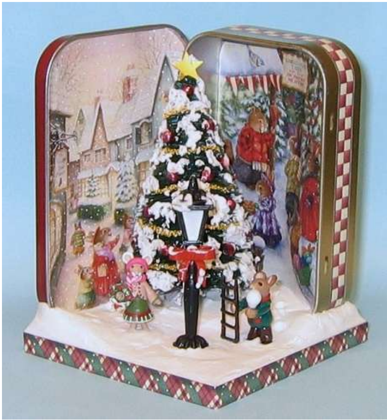
Preparing for the Big Snowball Fight with all the figures by Loredana Tonetti.