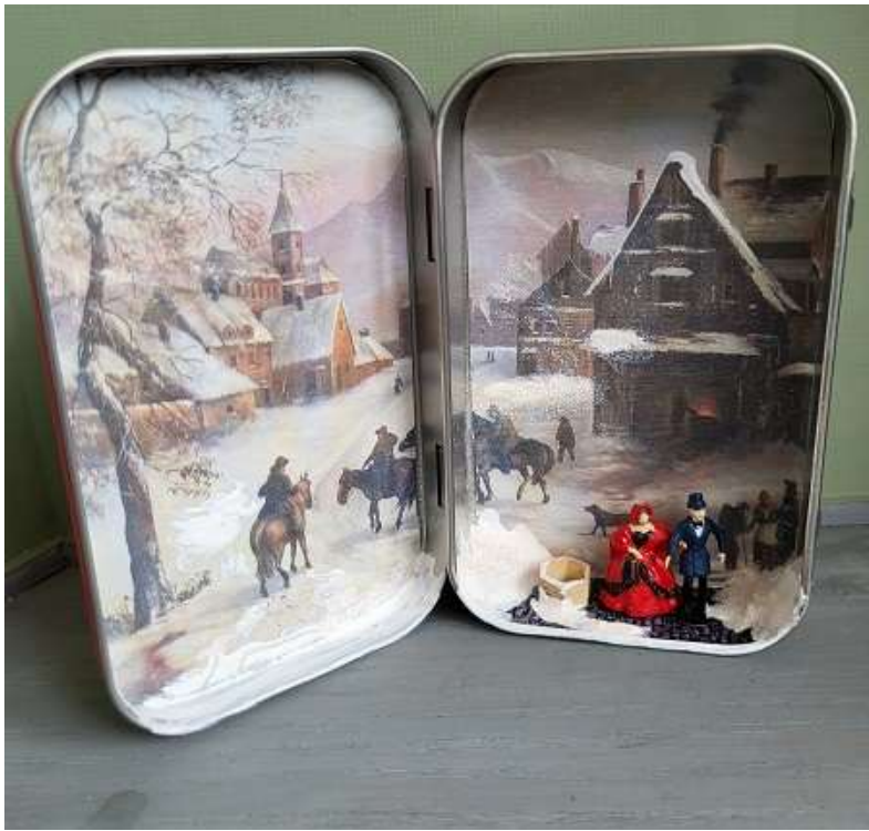
A scene in the snow with a figurine using Christmas cards.