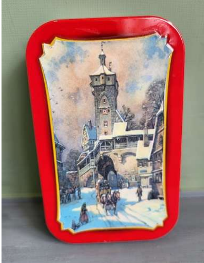
Wolf cubs howling at the moon.