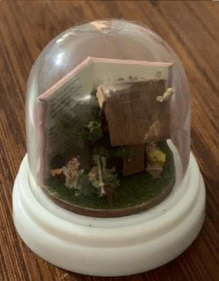
These are from the OLHP Splintered Fairy Tales.