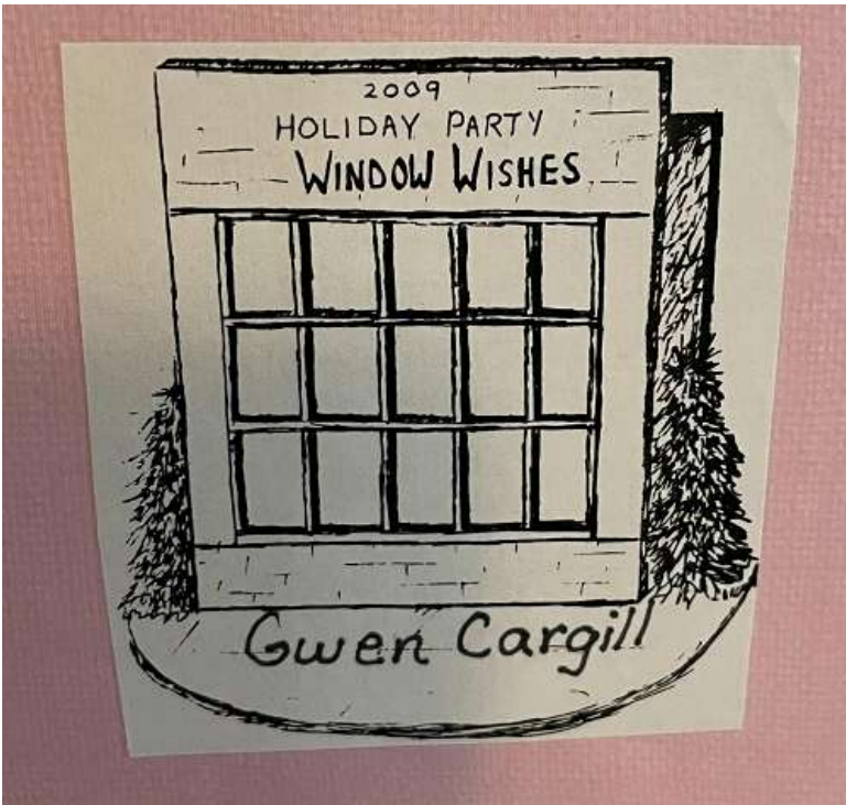
From Elaine Levine: