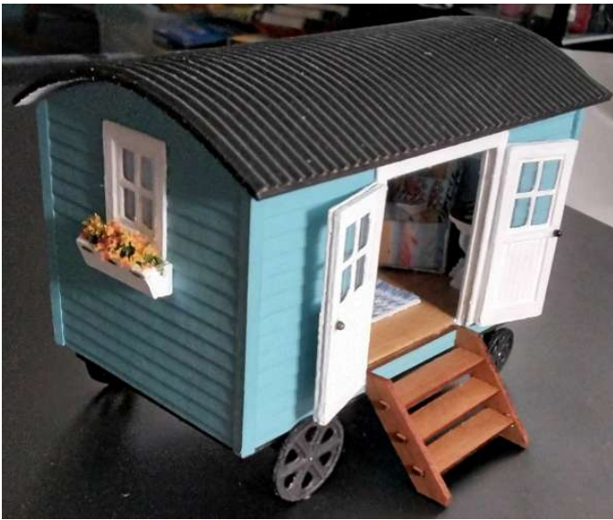
You just want to curl up and read a book. So inviting!