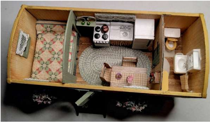
Julie French's Fortnight (while not quite done) looks like it will be a very nice quilt shop on wheels ...