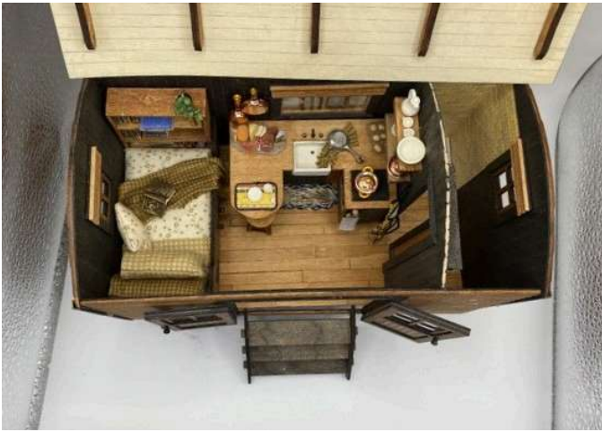
Check out those amazing blinds!!!