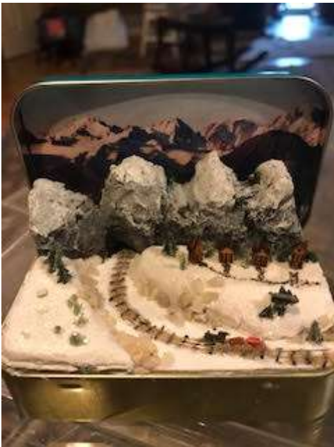
From Sue Ostheimer:

I made this small vignette at a regional workshop in 2011. The basic design and kit was by Cat Wingler and everyone was encouraged to then make their own scenes with it. I chose a Vermont type exterior with snow outside. We used to have a family house in Vermont and it was red with white trim and my father-in-law collected old