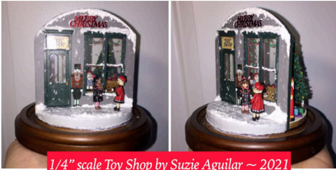
1/4" scale Toy Shop by Suzie Aguilar ~ 2021