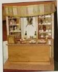
Bar created by Paula Francis

Then back to the project. When lined up for photos at days end, the results were colorful, interesting and great fun!