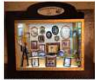
State Day project: Photography of the Ages by Margaret Gordus