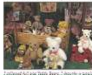
I collected all the Teddy Bears. I thought it would be fun to start my own bear collection.