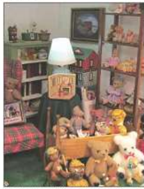
The mini desk space on the left is next to the chair in a replica of a conventional office space.