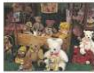
I chaired All our Teddy Bears. I thought it would be fun to start my own bear collection.