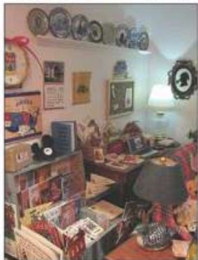
I purchased a suit case of the figurines on the desk.

I know the room is cluttered, but these are My Memories. I actually have five more plastic shoe boxes of things I wanted to use and it was hard to eliminate. I have made so many "forever friendships" with wonderful people from all over the US and Canada, because of NAME and my 10 years on the board. I could go to meet any large city and look up a friend. NAME has helped make the past 40 years a true delight. I have been truly blessed and I can't imagine my life without NAME. I think my jam packed miniature room depicts the niche I have always had. "She only get out of an organization, what you are willing to put into it." Thanks for the memories.