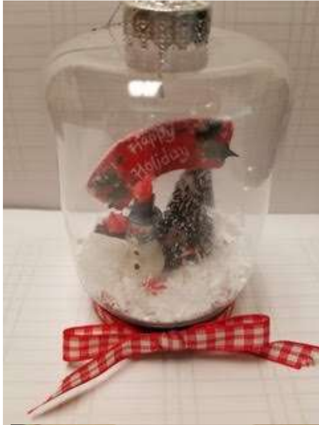
Christmas scene done inside a plastic ornament bought from the Dollar Tree.