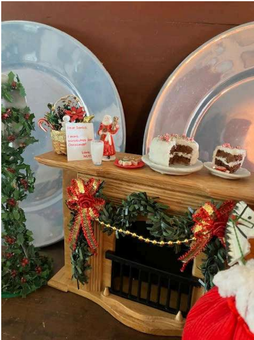
I added the hot chocolate.