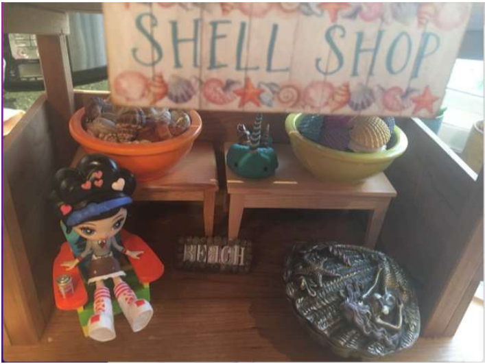
From Beverly Fleming: