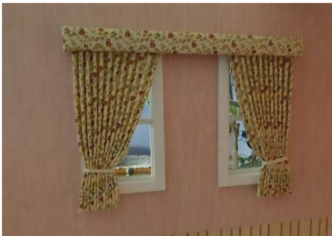
Window Treatment (7)