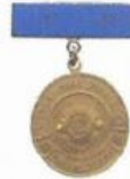
Lot 37 1968 Lions of Ohio "Dallas"