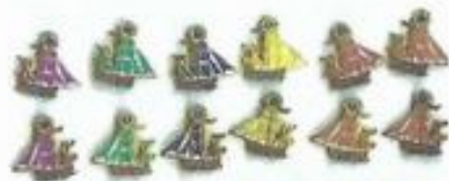
Lot 94 2006 PTCV (12) Mini Ship Set