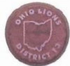
Lot 90 Ohio Undated Flashing Light Price $ 50 00