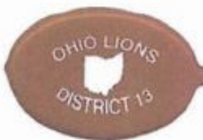
Lot 104 Ohio Squeeze Purse Price $ 35.00