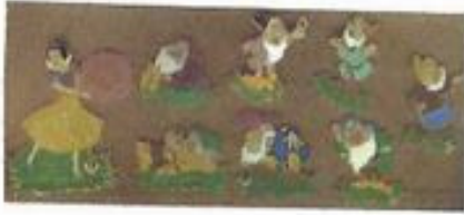
Lot 76 Original Snow White & Seven Dwarfs Price $ 20 00