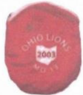
Lot 86 2003 Ohio Fan Case Price $ 25 00