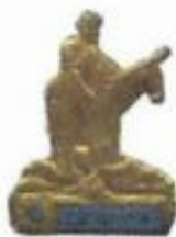
Lot 158 1958 MD-4 Price $ 50 00