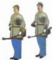
Lot 95 1970 Virginia Soldiers Gold & Silver Price $ 60.00