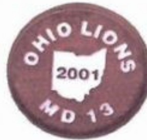
Lot 85 2001 Ohio Clip-on Flashing Light Price $ 5 00