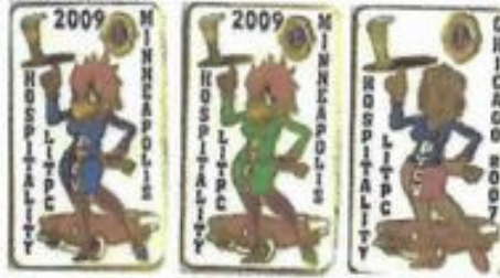
Lot 32 2007(1) 2009(2) LITPC Hospitality Room Handouts Price $ 30.00