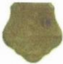
Lot 82 1939 Convention Fob Price $ 10 00