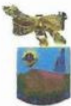
Lot 42 1976 New Hampshire Broach