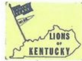
Lot 33 Undated Lions of Kentucky