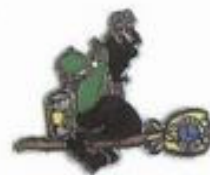
Lot 105 Casper—Broomhilda Cartoon Pins Price $ 35.00