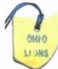
Lot 165 Early Ohio Ceramic—Blue Print Price $ 400 00