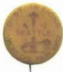
Lot 154 1962 MD-19 Button Price $ 25 00