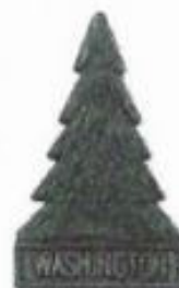
Lot 153 1952 PNW—Washington #1