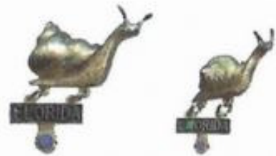
Lot 41 Two Florida Snails Green Base