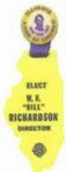
Lot 159 1959 Illinois Button with Yellow Banner Price $ 160 00