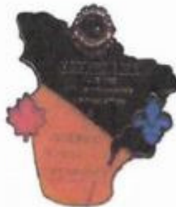
Lot 88 Quebec Pin Traders Life Member Pin Price $ 55 00