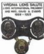
Lot 163 1969 Virginia Prestige David Evans Price $ 220 00