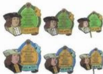
Lot 100 1981 PA (3) Green Set (3) Blue Set Price $ 140.00