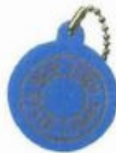
Lot 96 New York Blue Keychain Price $ 5.00