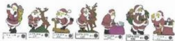
Lot 91 2004 CLPTA—Reno "Santa Set"