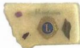
Lot 157 1969 Montana Price $ 140 00