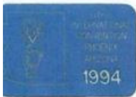
Lot 87 1994 Phoenix Convention LITPC Badge Price $ 20 00