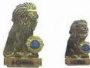
Lot 36 Undated Iowa Large & Small