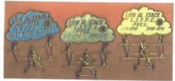
Lot 78 (3) Al Stack Airplanes Price $ 120 00