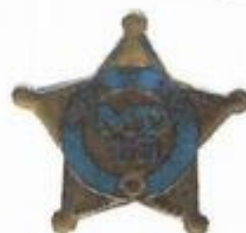
Lot 97 1985 MD-19 Special Price $ 10.00