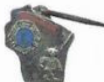
Lot 156 1962 Wisconsin Blue Dot Price $ 150 00