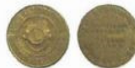
Lot 101 1967 Lions of Illinois Golden Anniv. Banquet Coin Price $ 50.00 x 2