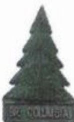
Lot 160 1952 PNW—British Columbia Price $ 500 00