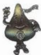
Lot 102 Undated Hershey Kiss Pin Price $ 70.00