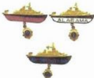
Lot 155 1976 Alabama Red/White/Blue Price $ 70 00