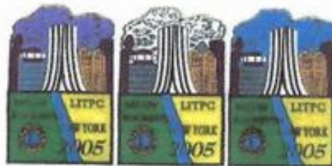
Lot 89 2005 LITPC (3) Rochester Swap Pins Price $ 30 00