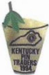
Lot 34 1994 Kentucky Pin Traders Pin