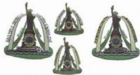
Lot 44 1990 New York Regular & Gold Border Set