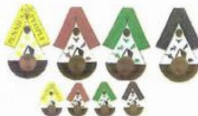
Lot 152 2004 Colorado Pin Traders "Pennies for People"