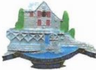
Lot 83 Nebraska Pin Traders Charter Pin Price $ 15 00