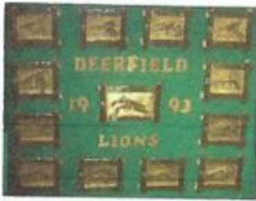
Lot 31 1993 Deerfield (12) Pistol Set in Frame