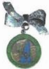
Lot 35 1974 New Hampshire Broach