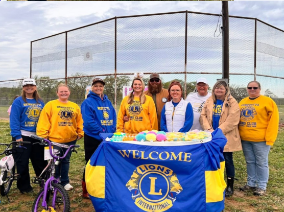
Vian Lions put out a new Eye Glass Box!