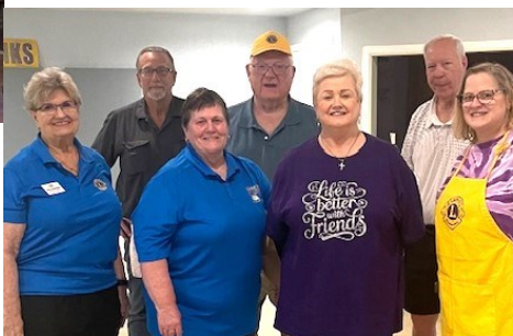
MidWest City Lions Club in action! BBQ Diner!

April 4 th West Side Lions participated in Heartland Council of the Blind Beeping Easter Egg Hunt. It's always a blessing to