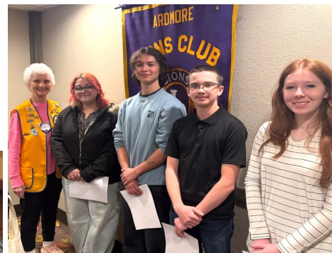
Ardmore Lions Club and Students celebrate success.