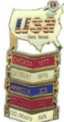
Lot 8 USA Forum with Danglers Price $ 15.00