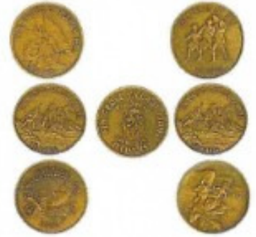
Lot 32 1976 Elk Grove Coin Set Price $ 12 00