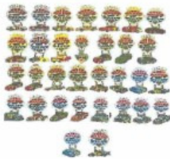
Lot 113 World 600 Complete Set Price $ 155 00