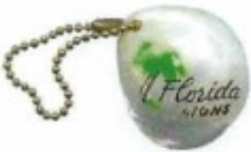
Lot 126 Florida Painted Seashell Price $ 45 00