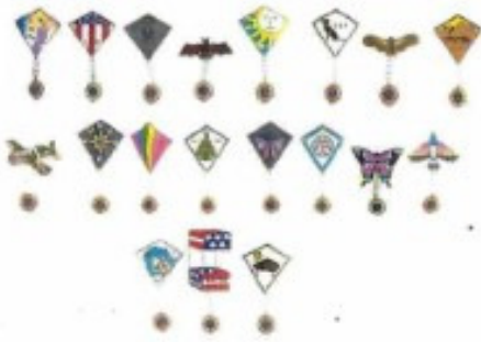
Lot 112 2006-07 PA Council Kite Set Price $ 20 00