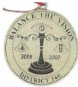
Lot 96 2006-07 District 14-E Ornament Price $ 5 00