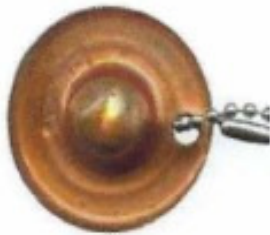
Lot 22 1949 Utah Hat w/tag Price $ 49.00