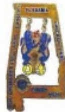
Lot 59 1980 Alabama Prestige Price $ 15.00