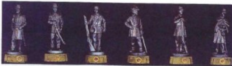
Lot 34 Six (6) Piece Civil War Set Price $ 65 00