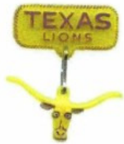
Lot 11 1955 Texas Steer/Plastic Purple Price $ 5.00