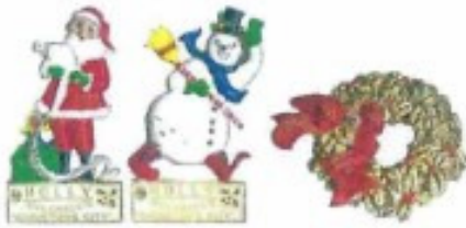
Lot 30 Holly— Santa, Snowman, Wreath Price $ 10 00