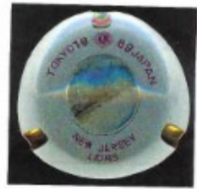
Lot 115 1969 NJ Decorative Ash Tray Price $ 25 00