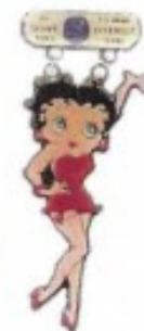
Lot 110 1987 District 14-H "Betty Boop" Price $ 60 00