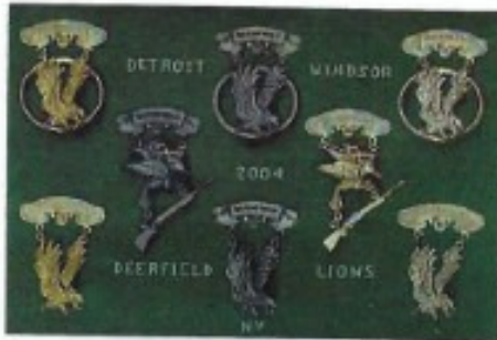
Lot 36 2004 Deerfield—8 Eagles Price $ 40 00