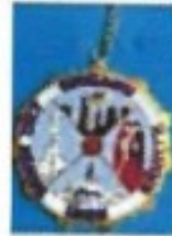
Lot 20 1980 1-A Chicago Medallion Price $ 5.00