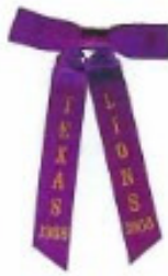
Lot 100 1968 Texas Purple Tie Price $ 15 00