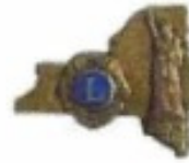
Lot 97 1964 New York (BRASS) Price $ 25 00