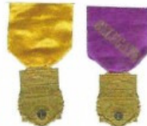
Lot 106 1961 Int. Conv. Badges Price $ 15 00