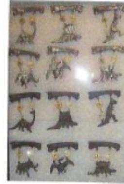
Lot 3 Barton Dinosaur 12 Piece Set Price $ 30.00