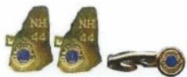
Lot 7 1971 New Hampshire Cuff Link Set Price $ 80.00