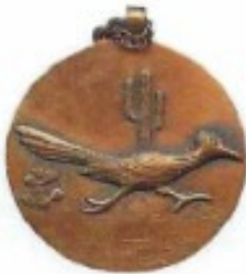
Lot 122 New Mexico Roadrunner Medallion Price $ 20 00