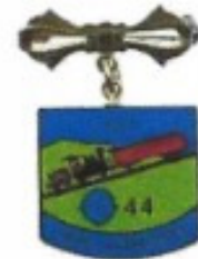
Lot 102 1977 New Hampshire Brooch Price $ 5 00