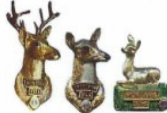
Lot 5 1980-1981, 1982 Montana Price $ 25.00