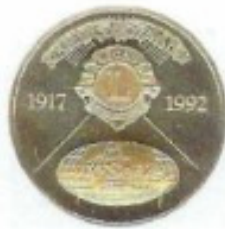
Lot 53 1992 Silver 70th Anniversary Coin # 1068 Price $ 30.00