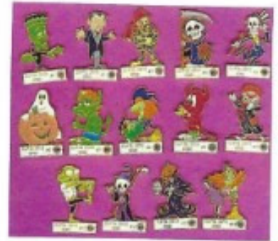
Lot 47 2013 CLPTA Halloween Set Price $ 32.00