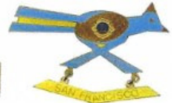
Lot 125 1974 New Mexico Large Undated Price $ 120 00