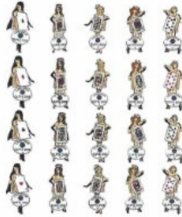
Lot 17 2009 California Pin Traders—20 Pin Set Price $ 27.50