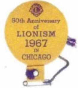
Lot 12 50th Anniv. Paper Chicago Tab Price $ 15.00