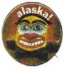
Lot 15 1963 Alaska Button Price $ 12.00