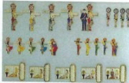
Lot 37 Twenty-Four (24) Hurley Girl Pin Set Price $ 40 00