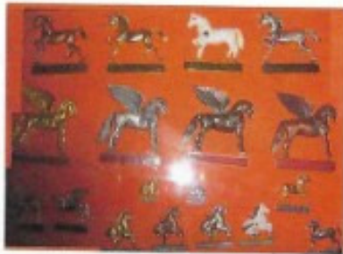
Lot 26 Various Texas Unicorn Pins Price $ 22.00