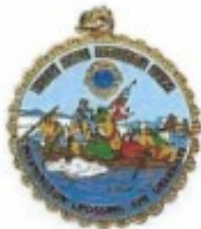
Lot 18 1976 NJ Small Medallion Price $ 25.00