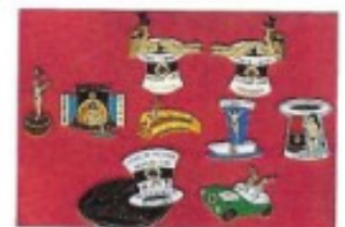
Lot 111 Nine (9) Tichigan Lake Pins Price $ 42 50