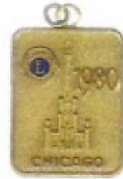
Lot 51 1980 Medallion 63rd Annual Convection Price $ 10.00