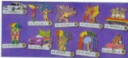
Lot 39 Gay Parade MD-A Pin Traders Price $ 10 00