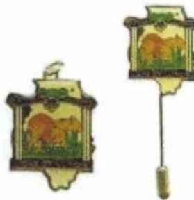
Lot 24 1999 Illinois Charm & stick Pin Price $ 2.00