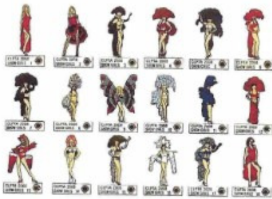
Lot 31 2008 California Pin Traders Show Girls Set Price $ 30 00