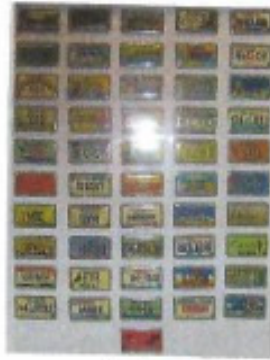
Lot 2 State License Plate Set Price $ 40.00