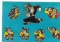
Lot 57 Mighty Mouse—7 Piece Set Price $ 35.00