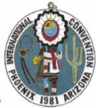
Lot 10 1981 Arizona Convention Medallion Price $ 6.00