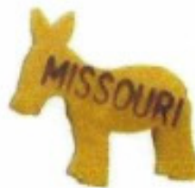
Lot 105 1960 Missouri Price $ 17 00