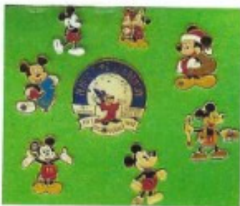
Lot 103 Eight (8) Different Mickey Mouse Pins Price $ 30 00