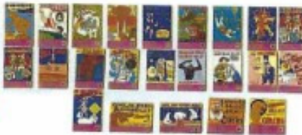
Lot 58 2006 CLPTA Circus Posters Price $ 20.00