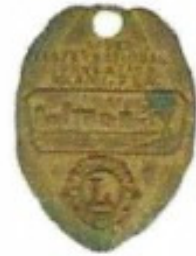
Lot 98 1927 Int. Conv. Badge Price $ 120 00