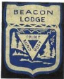
Lot 99 Beacon Lodge Patch Price $ 22 00