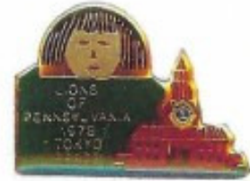
Lot 9 1978 PA Parade Pin Price $ 27.00