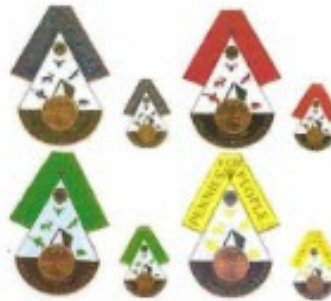
Lot 50 Colorado Pennies for people Price $ 25.00