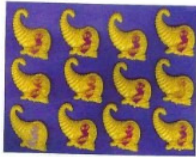
Lot 45 1956 New Jersey 12 Pin Numbers on back Price $ 45.00