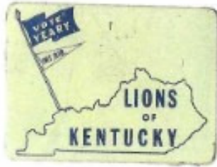
Lot 95 Lion of Kentucky Metal Pin Price $ 10 00