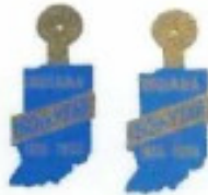
Lot 123 1966 & 1966V Indiana Metal Tabs Price $ 30 00