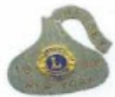
Lot 121 1966 Hershey Kiss Price $ 100 00