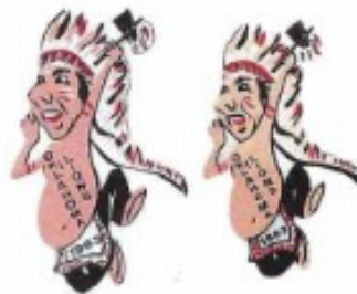
Lot 28 1963 OK Original & Duplicate Price $ 42.00