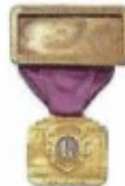
Lot 41 1937 Convention Badge Purple Ribbon Price $ 60 00