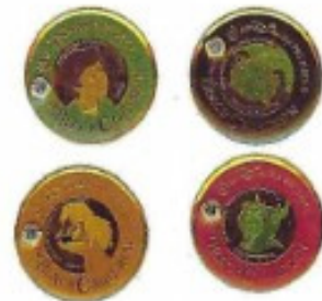
Lot 25 Disney Black Cauldron Set Price $ 55.00