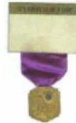
Lot 55 1954 International Convention Purple Ribbon Price $ 10.00