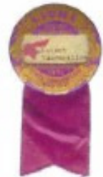
Lot 35 1951 PA Convention Badge Price $ 5 00