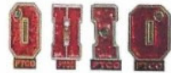
Lot 6 Ohio "Red Sparkle" Set Price $ 5.00