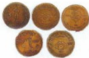
Lot 48 Five (5) Piece Coin Set Techumseh Lions Price $ 5.00