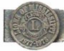
Lot 114 1978 Mississippi Money Clip Price $ 12.5 00