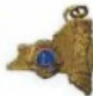
Lot 40 1964 New York Charm Price $ 50 00