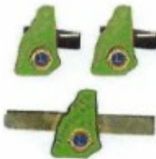
Lot 56 1969 NH Cuff Links & Tie Bar Price $ 15.00