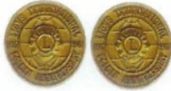
Lot 4 Lions International Cuff Links Price $ 5.00