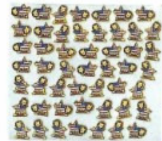
Lot 38 Fifty (50) State Lion & Flag Set Price $ 20 00