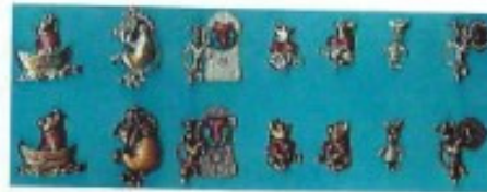
Lot 54 Winnie the Pooh—Silver & Copper Price $ 27.00