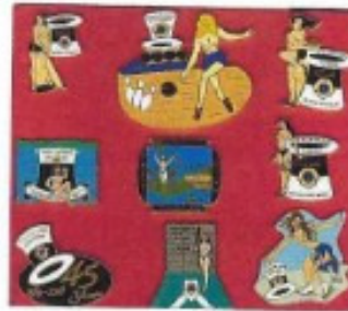
Lot 101 Eight (8) Tichigan Lake Price $ 65 00