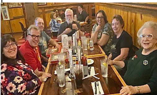
Diner Friday night at Buzzard Billy's in De Moines.