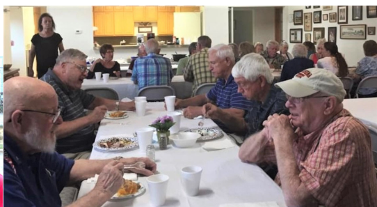
Stillwater and Perkins LC met for a great dinner.