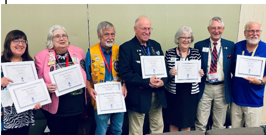
The 2021 Lions University graduates who were present in Iowa.

Seminole has Snowman Wonderland during the holidays.