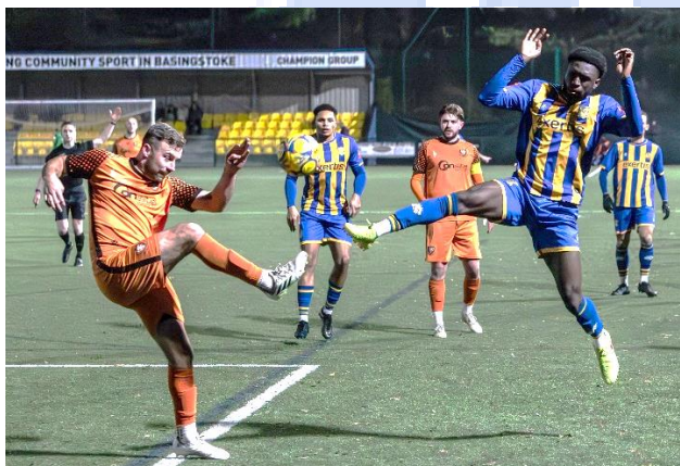
Stalwart defending from The Royals