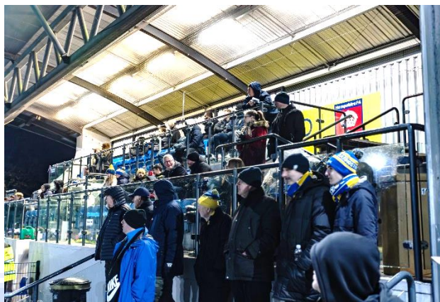
Basingstoke Town fans in the main stand