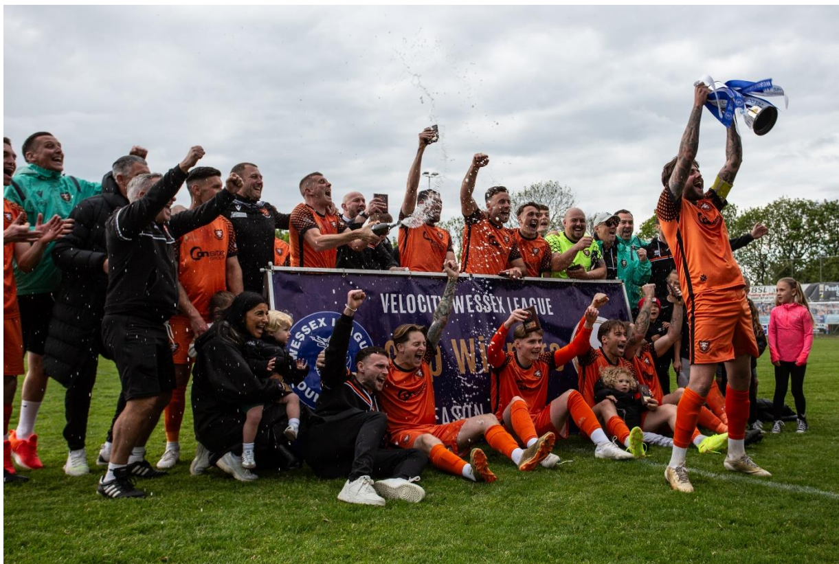
Continuing the cups aloft theme, here below are celebrations from Thursday night after AFC Portchester claimed the prize in the Russell-Cotes Benevolent Cup Final.