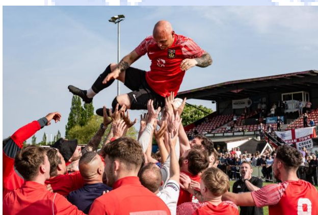
Fareham Town players celebrate a somewhat unexpected promotion from the Velocity Wessex Premier Division