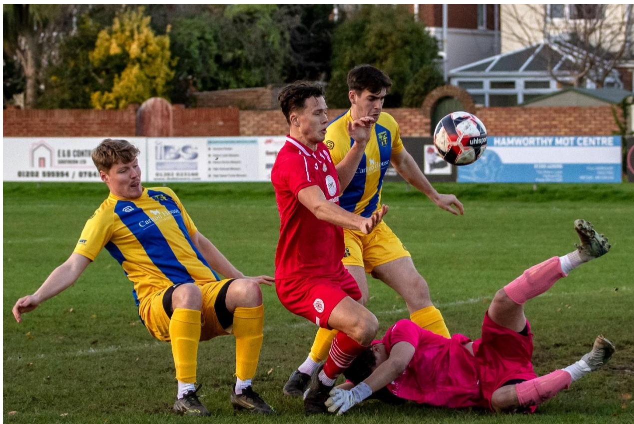
The only other Premier Division game played today was at Victoria Park, where Bournemouth (red) went down by the odd goal in five against New Milton Town.