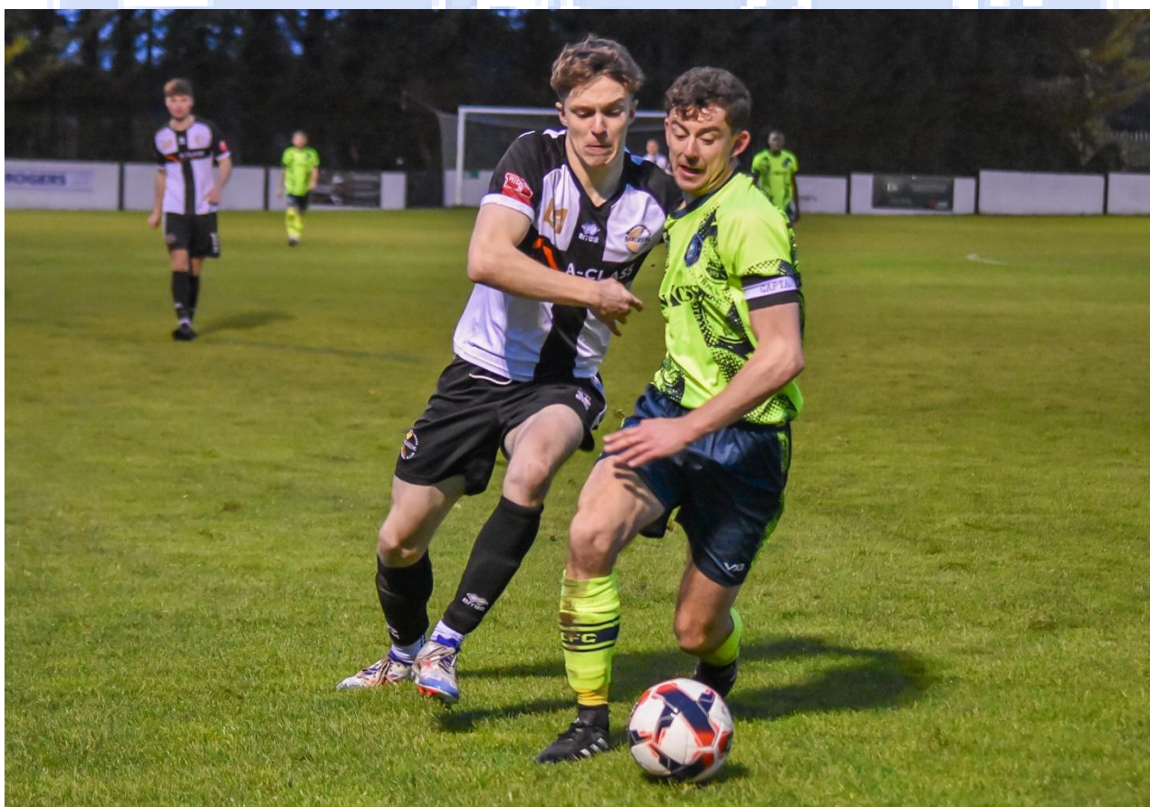
Action today from Bemerton Heath Harlequins (black and white) v Christchurch. The game ended two apiece in one of only two Premier Division games played