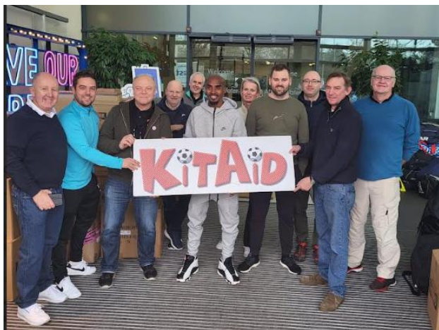
[Pictured above we see Mo Farah at Hatfield collecting for his Somalia Foundation, ]

Congratulations to AFC Stoneham and Hythe & Dibden on their wins today in the Isuzu FA Vase, looking forward to the Fourth Round draw to see whom they have got. This is the best season for the Mariners in this competition, in that it is the first time they have reached the Fourth Round. The three games postponed today have been re-scheduled for next Saturday- hopefully they will all enjoy success on the road.